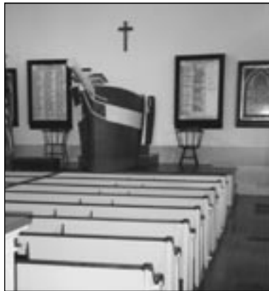
Interior, Seamen’s Bethel

Such was the capricious nature of my vessel, however. Before long, many of my carefully wrought expectations were disassembled with intimidating rapidity. This began, somewhat humorously, at my first point of interest, the famous Seamen’s Bethel where Ishmael heard his final sermon before boarding the Pequod . Real cenotaphs in memorial to lost seamen lined the walls, but a garish reproduction of Father Mapple’s famous pulpit, shaped like a ship’s prow, protruded from the front of the sanctuary. It was a stage prop, built in the 1950’s after too many tourists demanded their money back when they found only a standard-issue lectern instead.