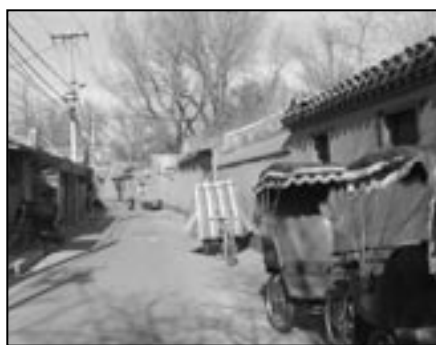
The fragile side of Beijing

Many of the renovations being done in Beijing are conceived with the intention of making the city more internationally friendly. There is an initiative to standardize English translations on street signs, and taxi drivers are reportedly involved in mandatory English training. Many of these changes are extraordinarily positive, like the push for more transparency in the state-run media and improved health care facilities. Many others seem too fast and too dramatic. Part of